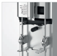
Adjustable portafilter support