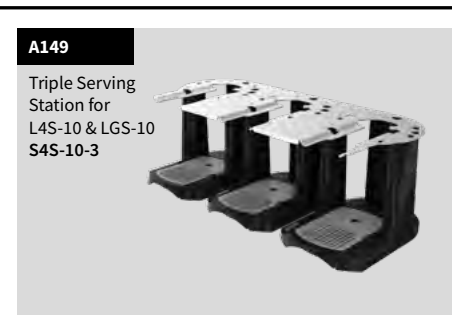
All dispensers and serving stations SOLD SEPARATELY.