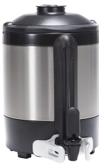
TF SERVER, 1.5G MECH NOBASE GEN3