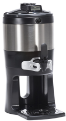
TF SERVER, 1G DSG GEN3