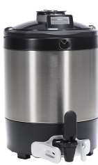
TF SERVER, 1.5G DSG GEN3 NOBASE