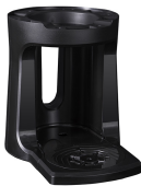
STAND ASSY, TF SERVER GEN3