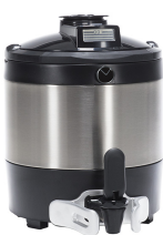
TF SERVER, 1G DSG GEN3 NOBASE