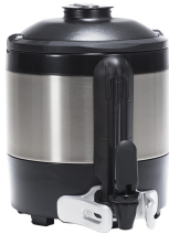
TF SERVER, 1G MECH GEN3 NOBASE