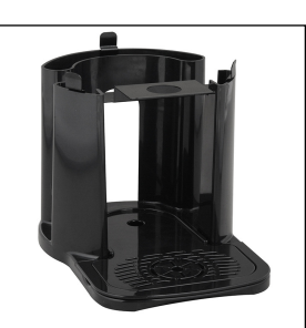
STAND ASSY, TF SERVER