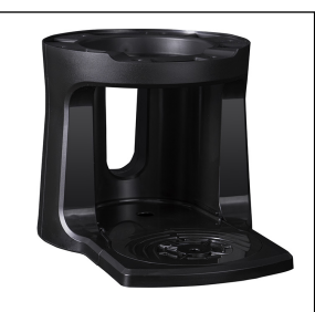
STAND ASSY KIT, TF SERVER