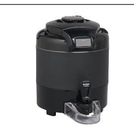
TF SERVER, DSG2 1G BLK NOBASE