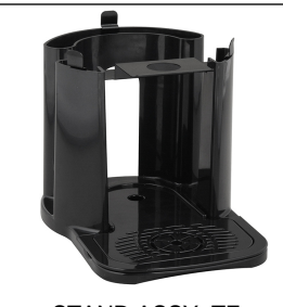
STAND ASSY, TF SERVER