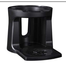
STAND ASSY KIT, TF SERVER