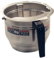
FUNNEL AY,W/DECAL GRT "C"7.62