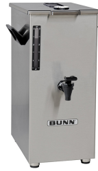
TD4T, BREW THRU LID NO DECAL NUDGER HDL