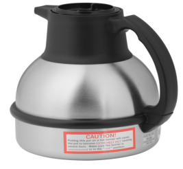
THERMAL CARAFE, ORN 1.9L 12PK