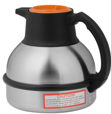
THERMAL CARAFE, ORN 1.9L 1PK