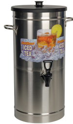
TDS-3.5, 3.5 GAL