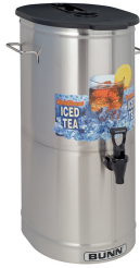
TDO-5, RESERVOIR, BREW THRU