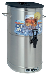
TDO-4, RESERVOIR BREW THRU