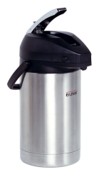
AIRPOT, 3.0L SST LA SINGLE PK