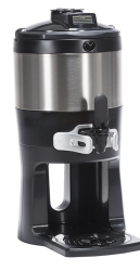
TF SERVER, 1G DSG GEN3