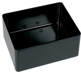
DRIP TRAY Product #: 02545.0000