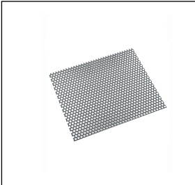
COVER, DRIP TRAY-PERFORATED