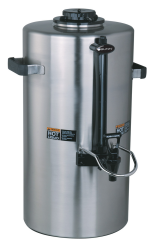
TITAN TF SERVER, VERTICAL FCT