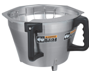
FUNNEL ASSY W/ BASKET, TITAN