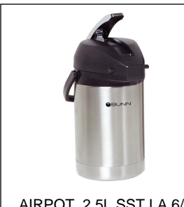
AIRPOT, 2.5L SST LA 6/ CASE