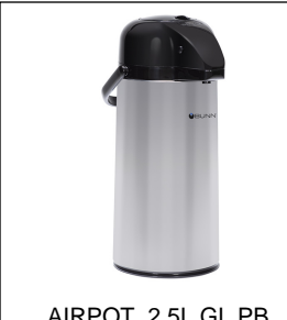
AIRPOT, 2.5L GL PB SINGLE PK