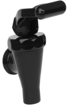
FAUCET ASSY, BLACK NUDGER Product #: 03260.0019