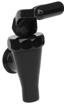
FAUCET ASSY, BLACK NUDGER Product #: 03260.0019