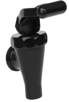
FAUCET ASSY, BLACK NUDGER