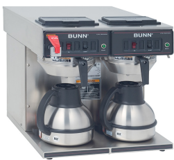
CWTF TWIN-TC, 120/240V SF