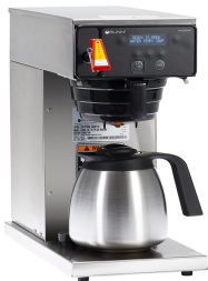
AXIOM-DV-TC, PF SST HOUSING