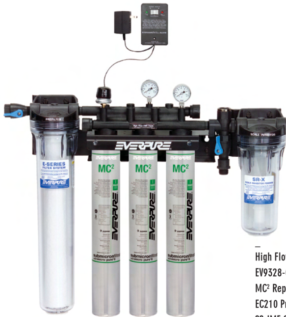
High Flow CSR Triple-MC 2 System with LPA: EV9328-05 MC 2 Replacement Cartridge: EV9612-56 EC210 Prefilter Cartridge: EV9534-26 SS-IMF Cartridge: EV9799-32

Delivers premium quality water for combination applications